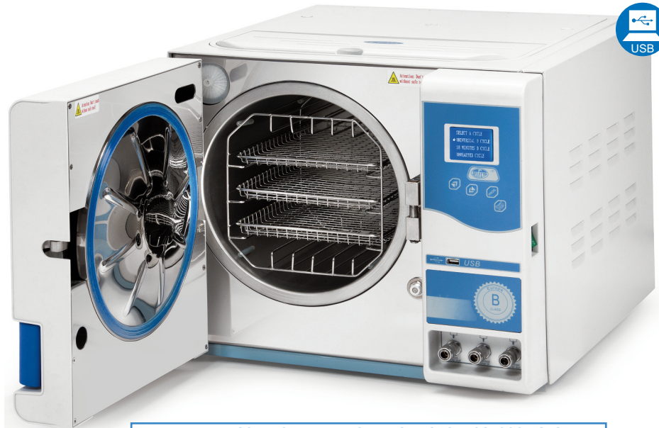
TEMPERATURE CONTROL AND AUTOMATIC MICROPROCESSOR CYCLE.